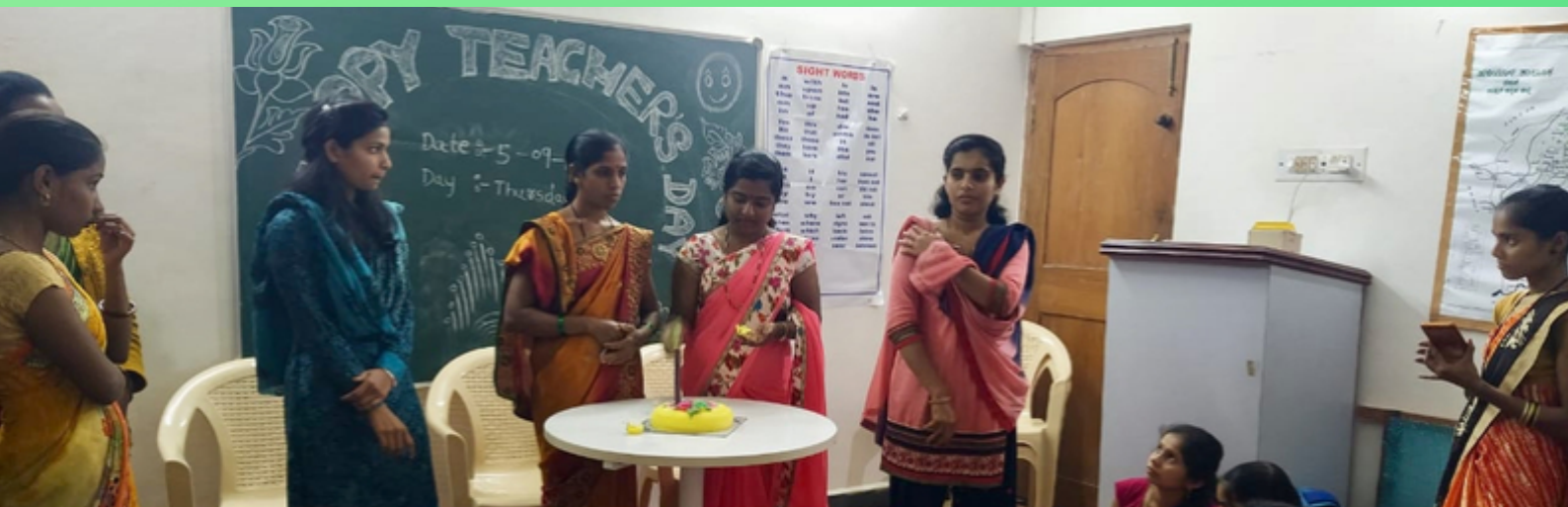
Teacher's Day celebration with our Learning Facilitators