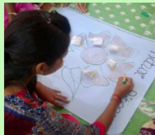
LFs learning and sharing teaching methods during the Peer Learning sessions