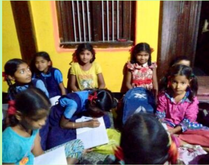
Students learning at the Phase II Shikshas that have started in Haliyal