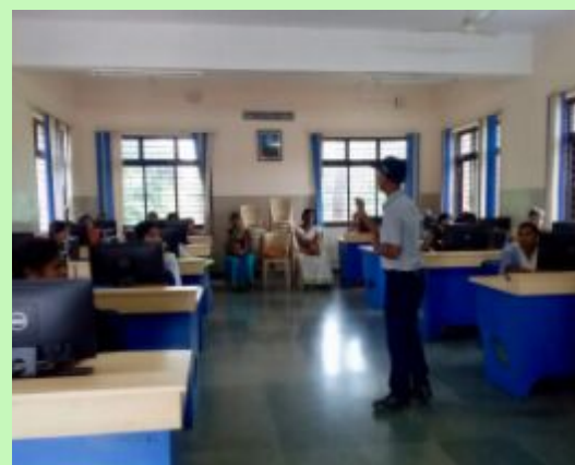
Top: 20 trainees in multimedia classrooms at DPITI