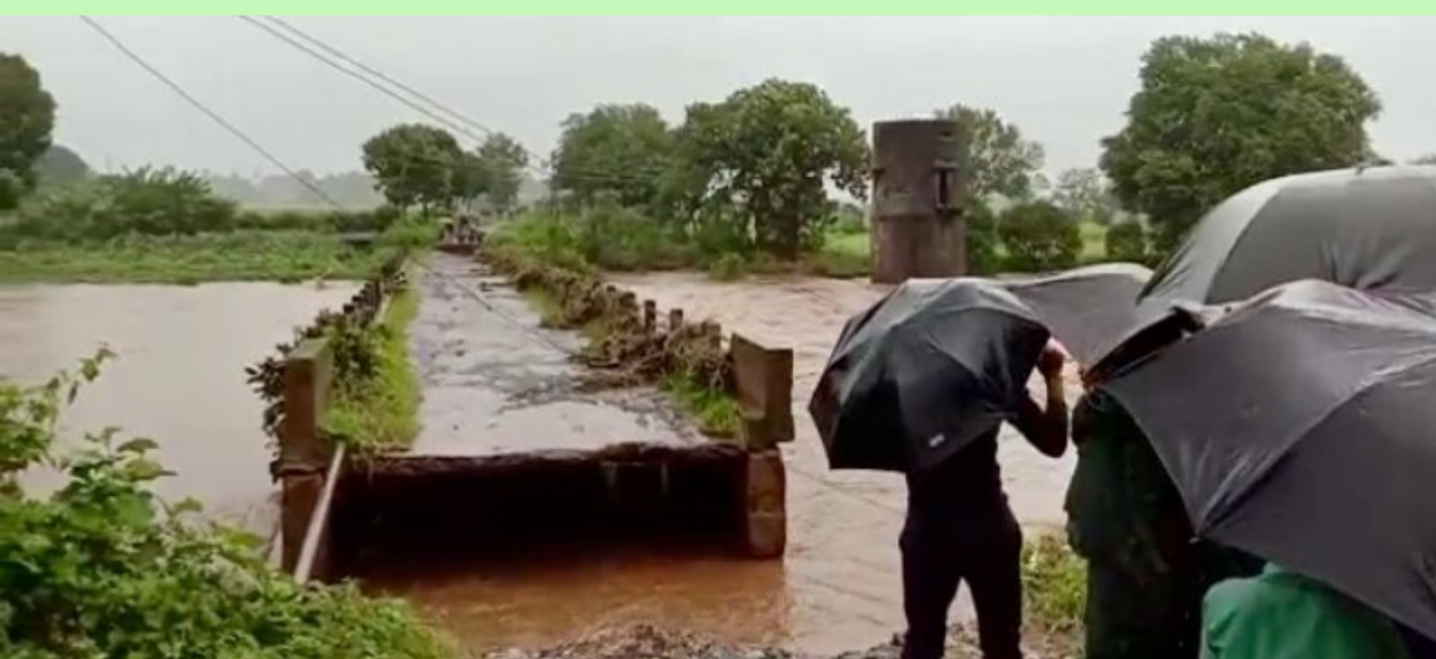
Bridge in Hunswad village of Haliyal that suffered serious damage during the floods