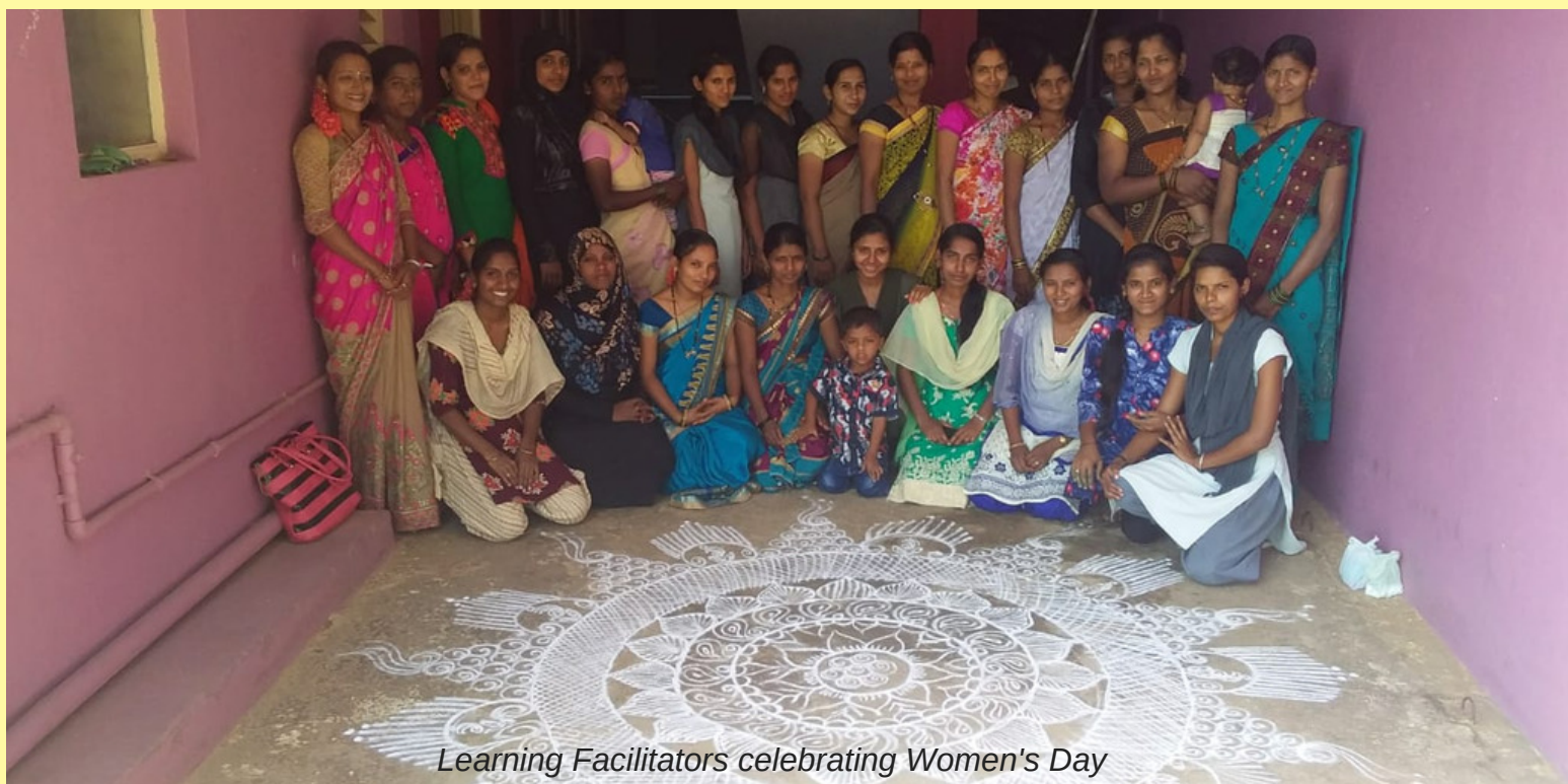
Learning Facilitators celebrating Women's Day