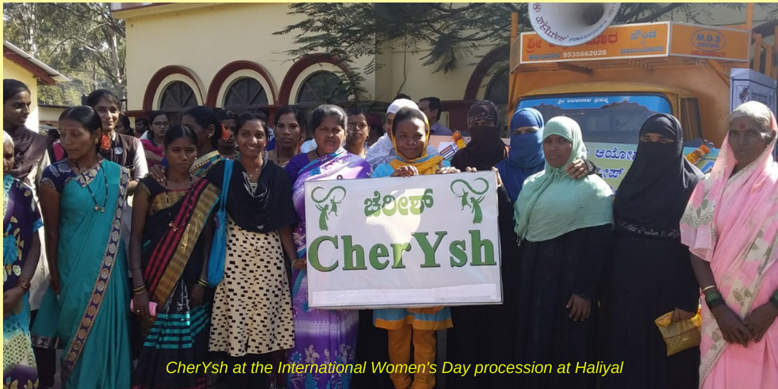
CherYsh at the International Women's Day procession at Haliyal

festivities organised by the government. Various fun events were conducted in the villages where women engaged in friendly competitions, games and cultural events and Learning Facilitators anchored the celebration in their respective villages