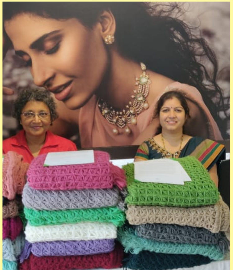
Glimpses from "Jewellery for a cause " fundraiser event