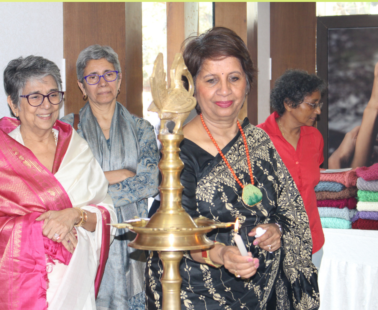
Dr. Nirupama Menon Rao inaugurating "Jewellery for a cause" by Srishti Fine Jewelry in support of CherYsh