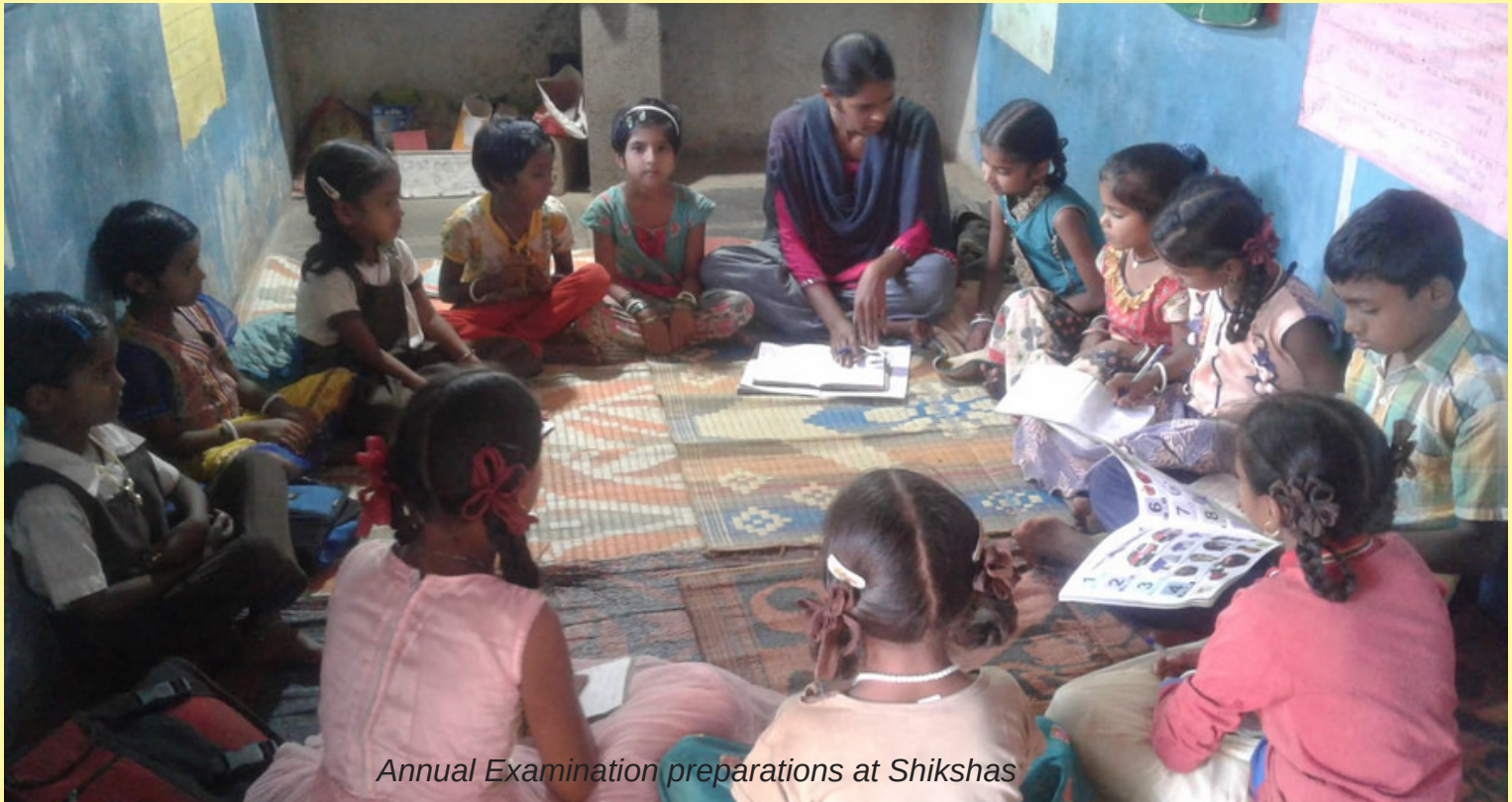
Annual Examination preparations at Shikshas

The Shikshas were busy with preparations for annual examinations during the past month. Study circles were formed and the Learning Facilitators helped children with their examination syllabus. The Shikshas will close for summer holidays after the exams.