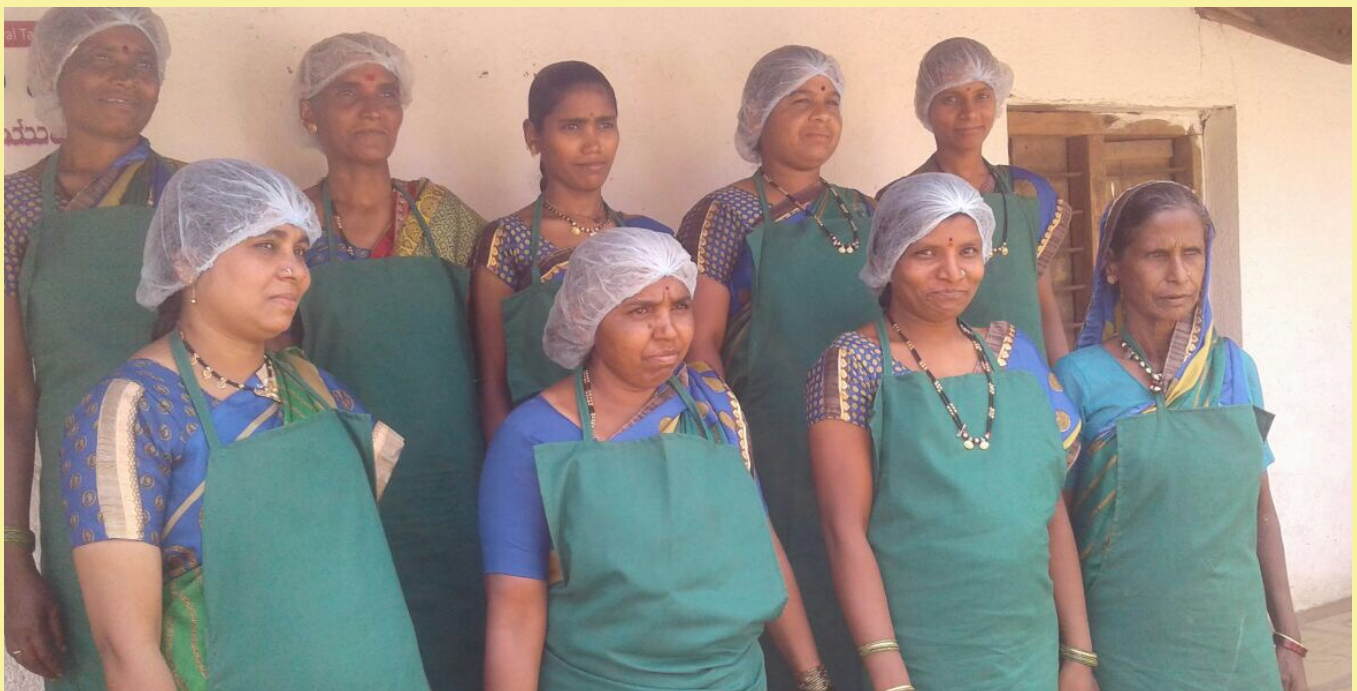
Members of CherYsh Kitchen Enterprise