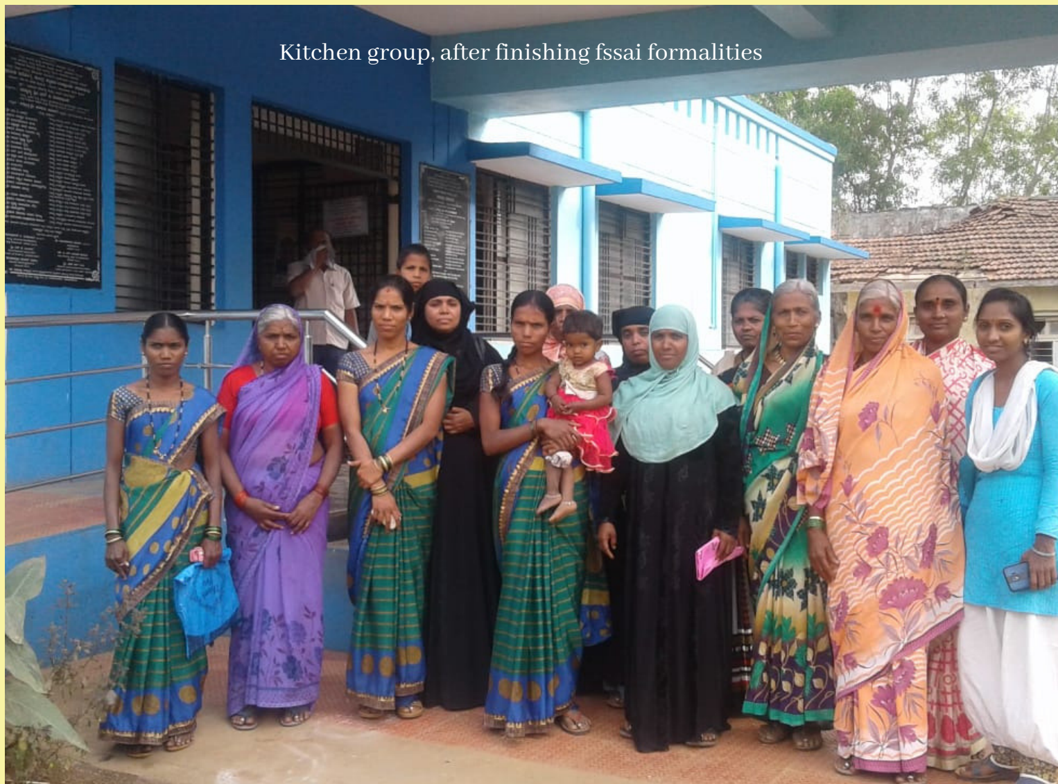
Kitchen group, after finishing fssai formalities

More than seven packaged food items are registered under the number. With the new registration in place, CherYsh Kitchen enterprise looks forward to expanding business, thereby bringing more livelihood opportunities to the women in the villages of Haliyal.